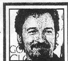
Bear necessity... Bruce