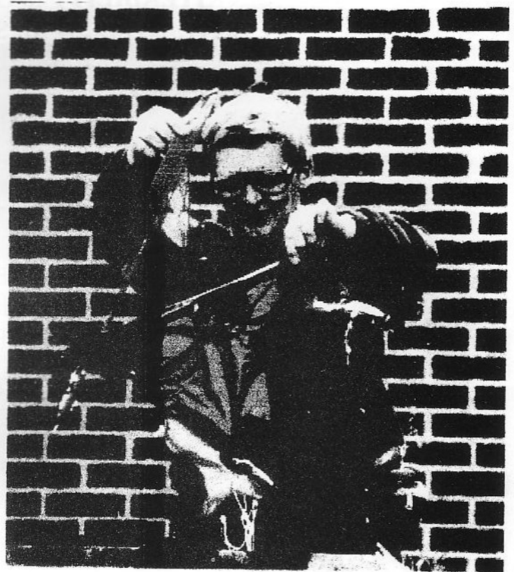
The BOF's last known contact with a kite of more than one line - Basingstoke '96

hot water bottle but who else could go to the workshop on sticking kites together and go home to finish the kite on a sewing machine, change the trailing edge design of a Mockform or make one of Bazzar's fantastic Celtic knot hexagons with a pattern in black on black? And they all flew.