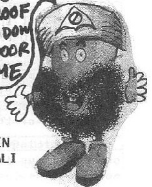
DUSTY BIN LADEN TALI TEDDY

I DONT SLEEP WELL THESE DAYS, ALL I DO IS DREAM OF RED DOTS ON THE ROOF THE WINDOW THE DOOR AND ME