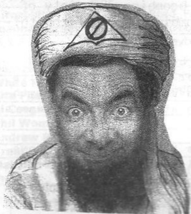
MR BEAN LADEN TALI TEDDY