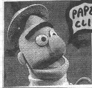
generated image of what Bin Liner now looks like.

THE world's top intelligence experts believe that the world's most wanted terrorist Osama bin Liner will by now have had a complete makeover. He will almost certainly have shaved off his beard, grown his hair long and dyed it blond. The picture shows a CIA computer-