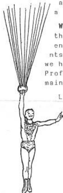
'Sailed majestically down'